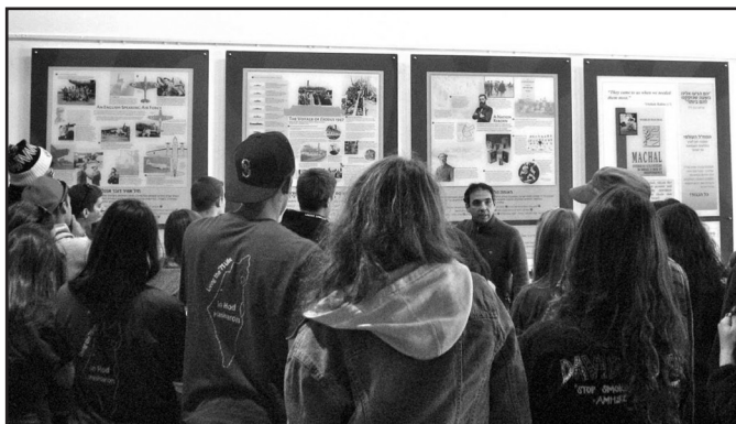
Students learning about the role of Machal volunteers in 1948 at the Machal Exhibit at Ammunition Hill

Information on purchasing a plaque is available at the JNF Web site at www.jnf.org/ammunitionhill or e-mail me at drjason1@cox.net .