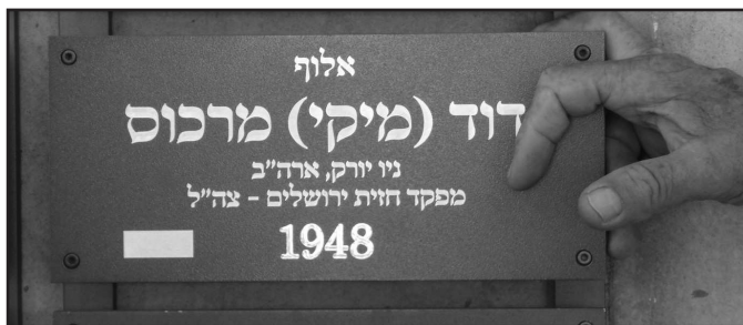
Col. Mickey Marcus on the Wall of Honor at Ammunition Hill