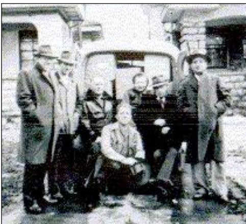
Surrounded by family, the author's grandparents are seated on the left and middle of the truck to take the boxes of arms for Israel to the Kansas City railroad station.

Not long after Israel's War of Independence was launched, a high school friend of my father's returned to Kansas City from a visit to Israel. Enthusiastically, he drafted my father, grandparents and other relatives in a frantic attempt to help the fledgling State of Israel. Just three years after the end of World War II, weapons could be found throughout the community as soldiers who returned home from war often brought with them rifles and other weaponry. My family was determined to gather as many arms as possible and ship them to assist Israel.